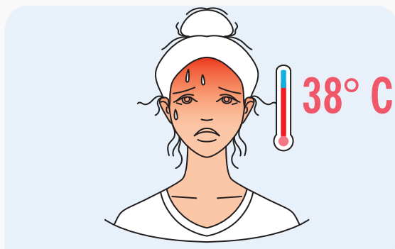
Fiebre / Fever