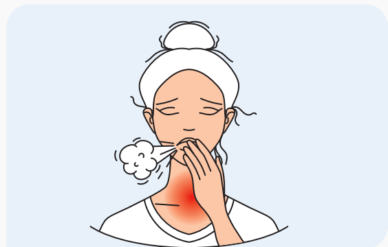
Tos Seca / Dry cough