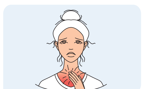
Dolor de Garganta Sore throat