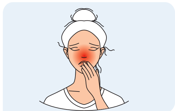
Congestión Nasal Nasal Congestion