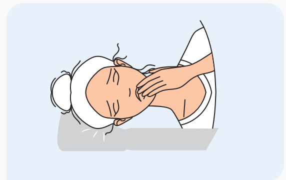
Cansancio / Fatigue