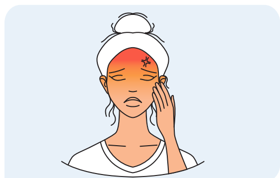
Dolor de cabeza Headache