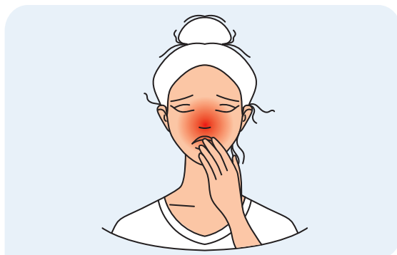
Secreción Nasal Runny Nose